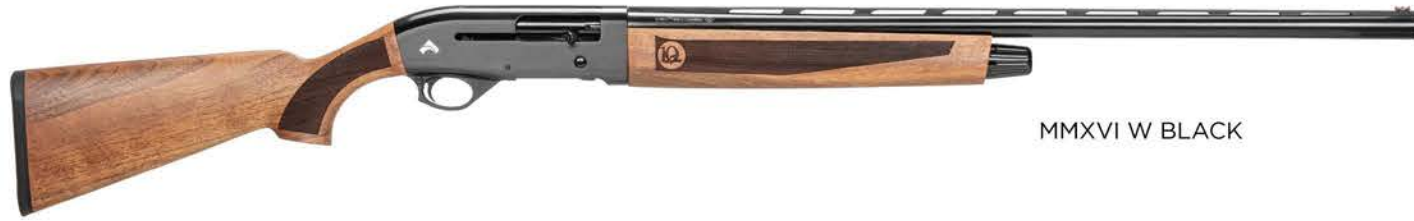
MMXVI W BLACK