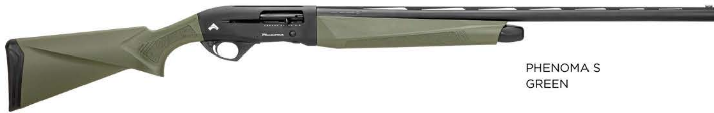
PHENOMA S GREEN