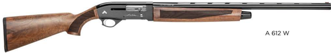
A 612 W