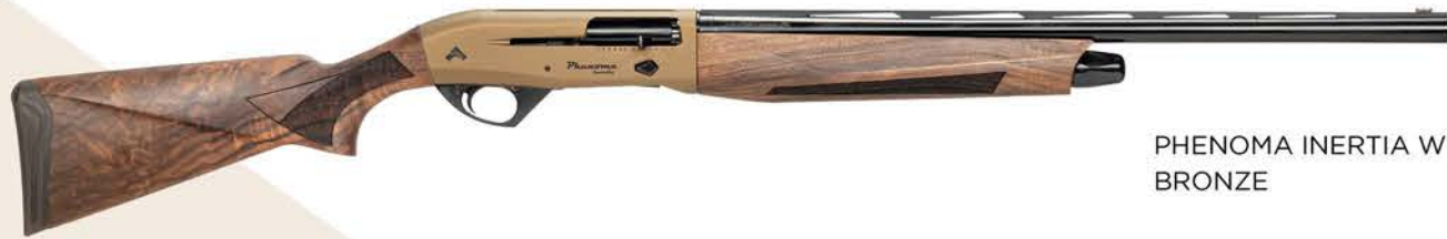
PHENOMA INERTIA W BRONZE