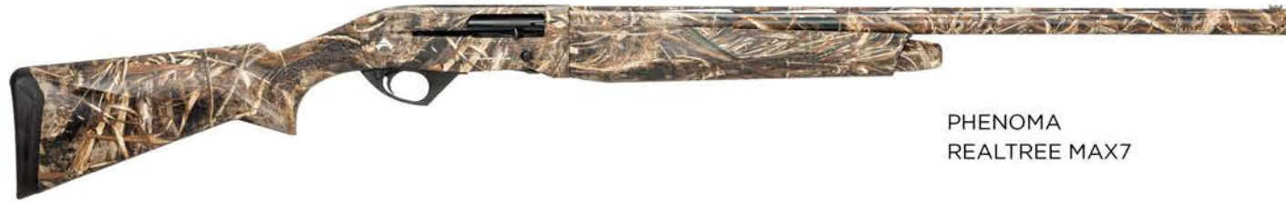
PHENOMA REALTREE MAX7