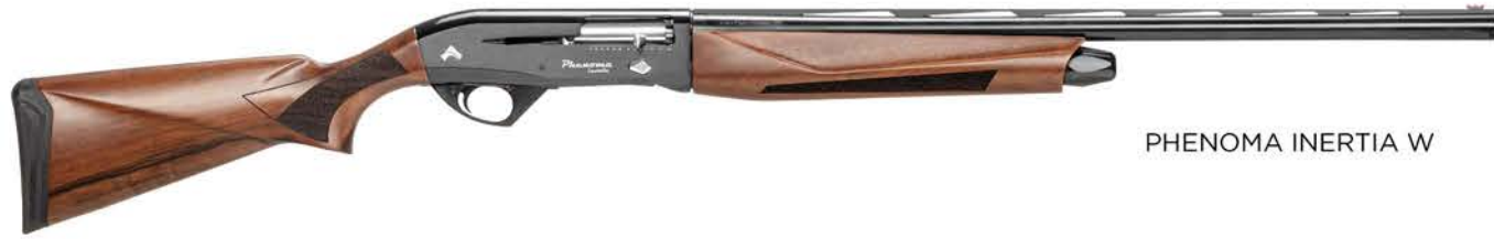
PHENOMA INERTIA W