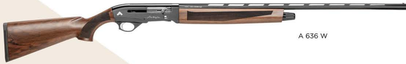
A 636 W