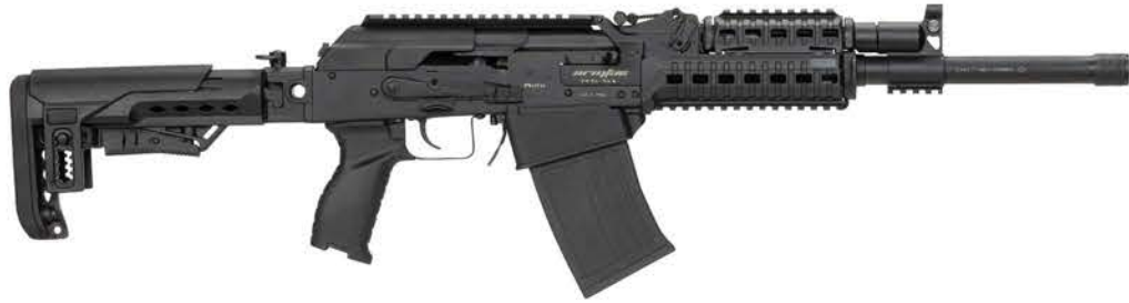
RS S1 S