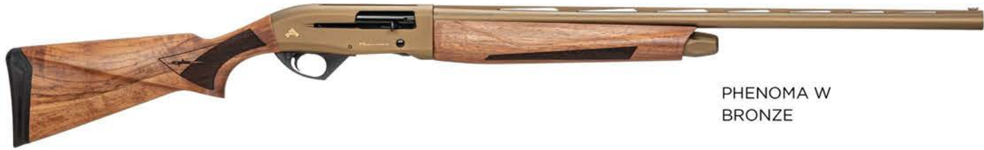
PHENOMA W BRONZE