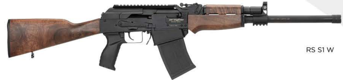
RS S1 W