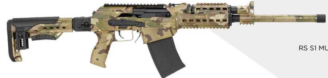
RS S1 MULTICAM