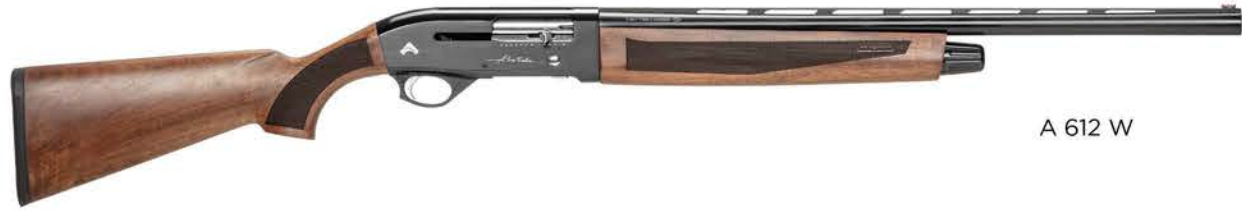
A 612 W