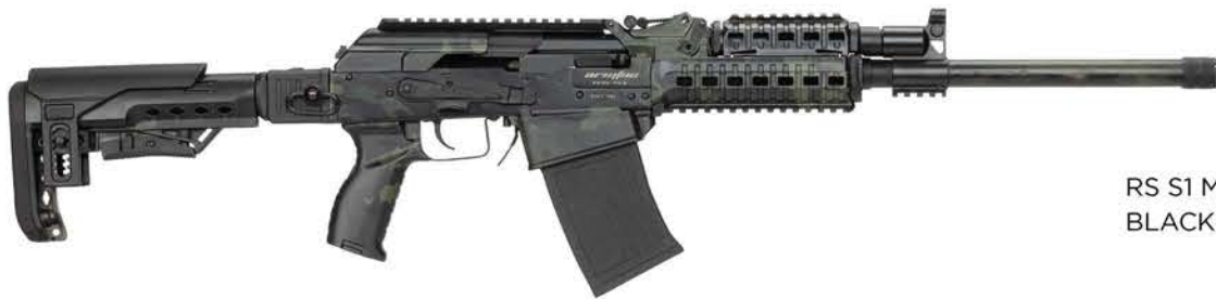
RS S1 MULTICAM BLACK