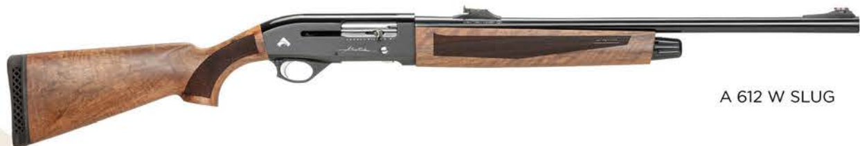
A 612 W SLUG