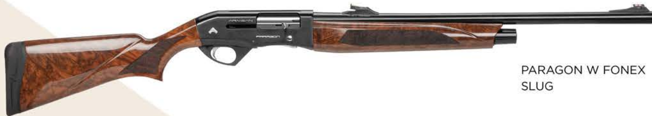
PARAGON W FONEX SLUG