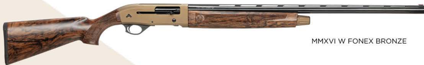
MMXVI W FONEX BRONZE