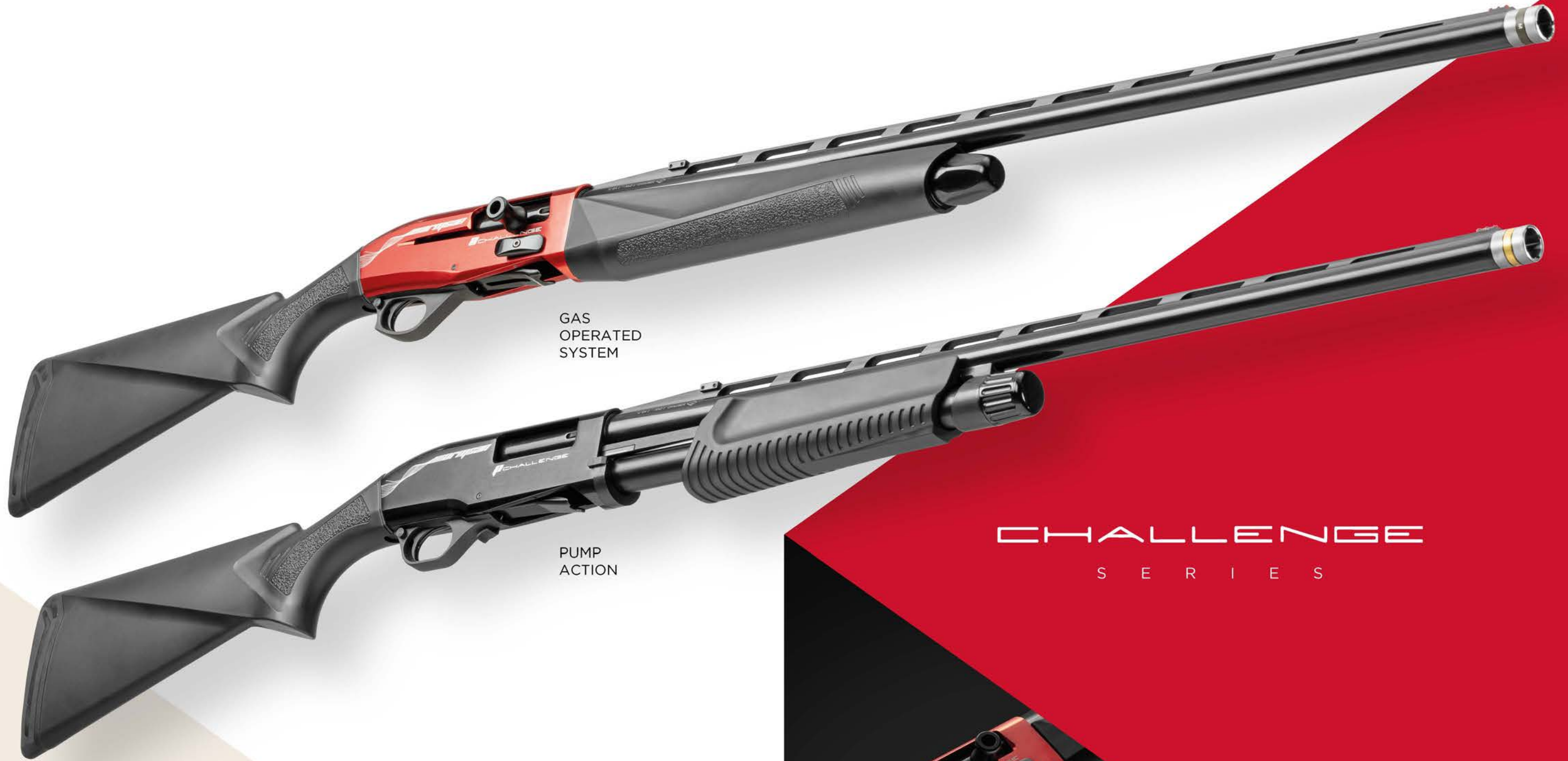
GAS OPERATED SYSTEM