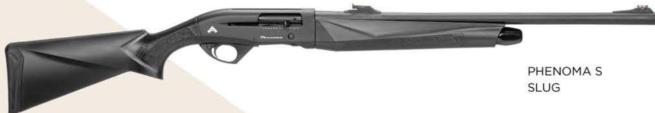
PHENOMA S SLUG