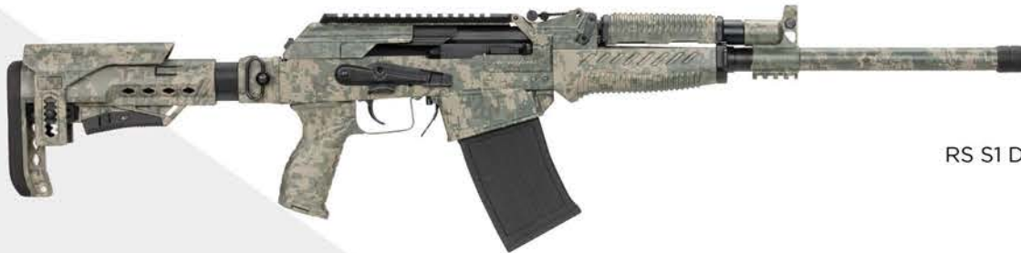
RS S1 DIGITAL ARMY