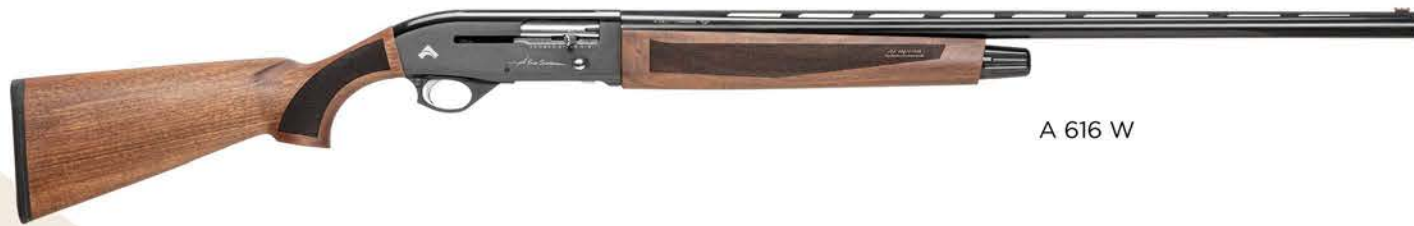
A 616 W