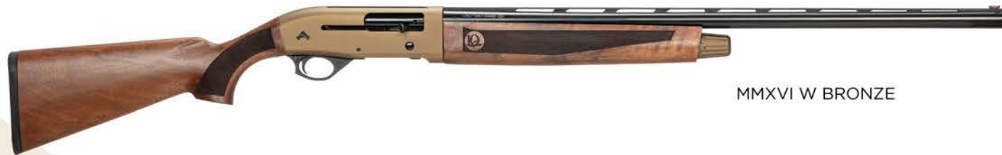
MMXVI W BRONZE