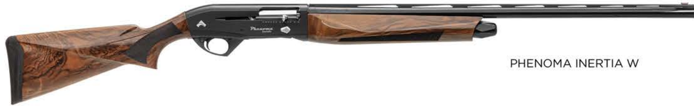
PHENOMA INERTIA W