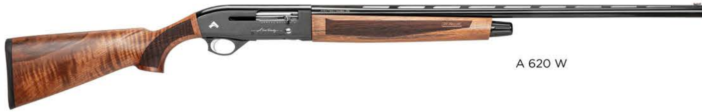
A 620 W