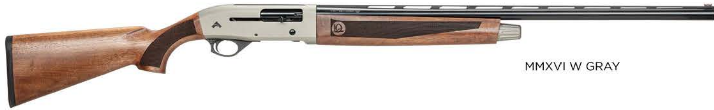
MMXVI W GRAY