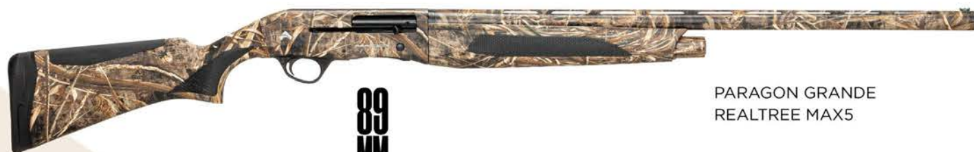
PARAGON GRANDE S