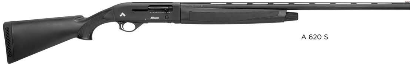
A 620 S