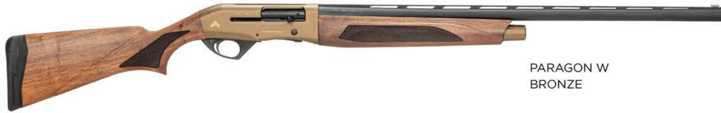
PARAGON W BRONZE