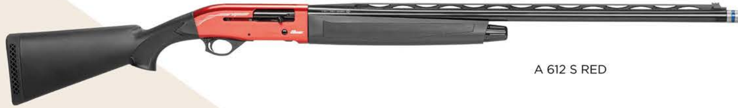
A 612 S RED