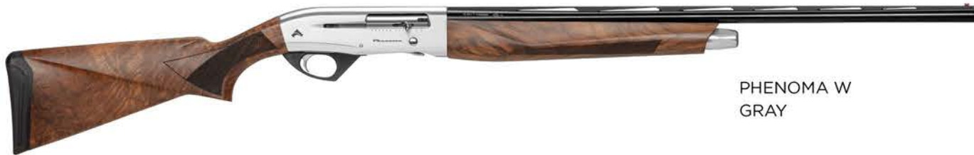
PHENOMA W GRAY